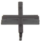
KDS-Inlay 4 BK 28518.4