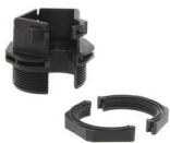
KDS-KV M32 BK 28612.4