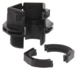
KDS-KV M25 BK 28611.4