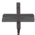
KDS-Inlay 4 BK 28518.4