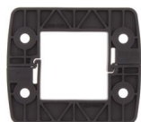
KDS-IVR 1-4 BK 28507.4