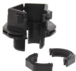
KDS-KV M20 BK 28610.4